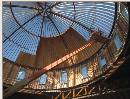
Image top left: Holy Nativity Romanian Orthodox Church, Chicago, IL; Image bottom right: The Catholic Church of St. Michael, MN

You receive a comprehensive timeline identifying milestones required to hit your delivery schedule. Dome solutions arrive at the jobsite with detailed 3D drawings and installation instructions for quick and easy assembly and one of our Design Technicians will be available to you throughout the project.