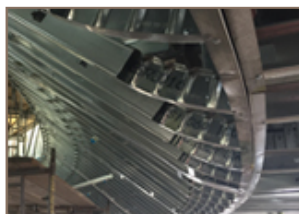
Curved-Right® Del Amo Fashion Center, Torrance, CA